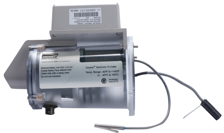
ETC with AMR device installed