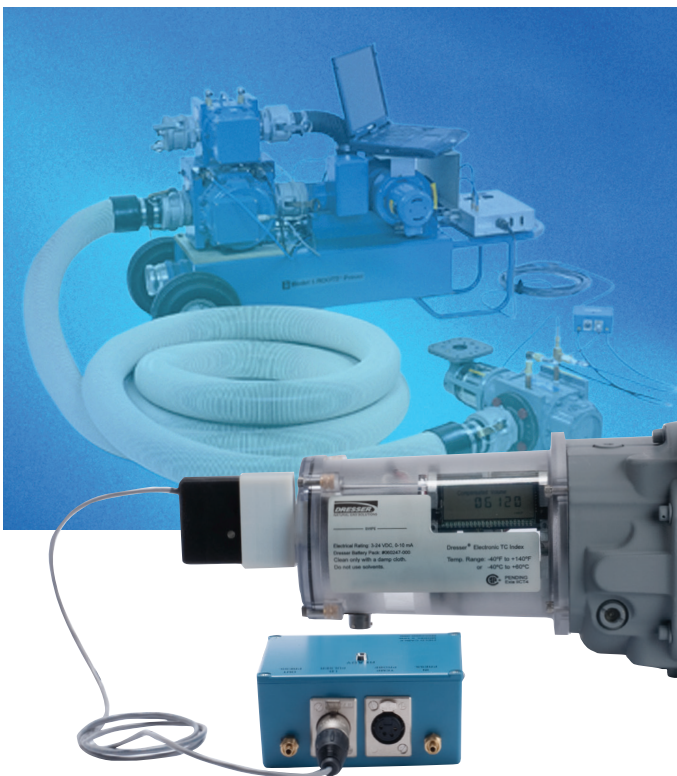
Infrared ETC Prover Cable Connected to Model 5 Prover Field Junction Box